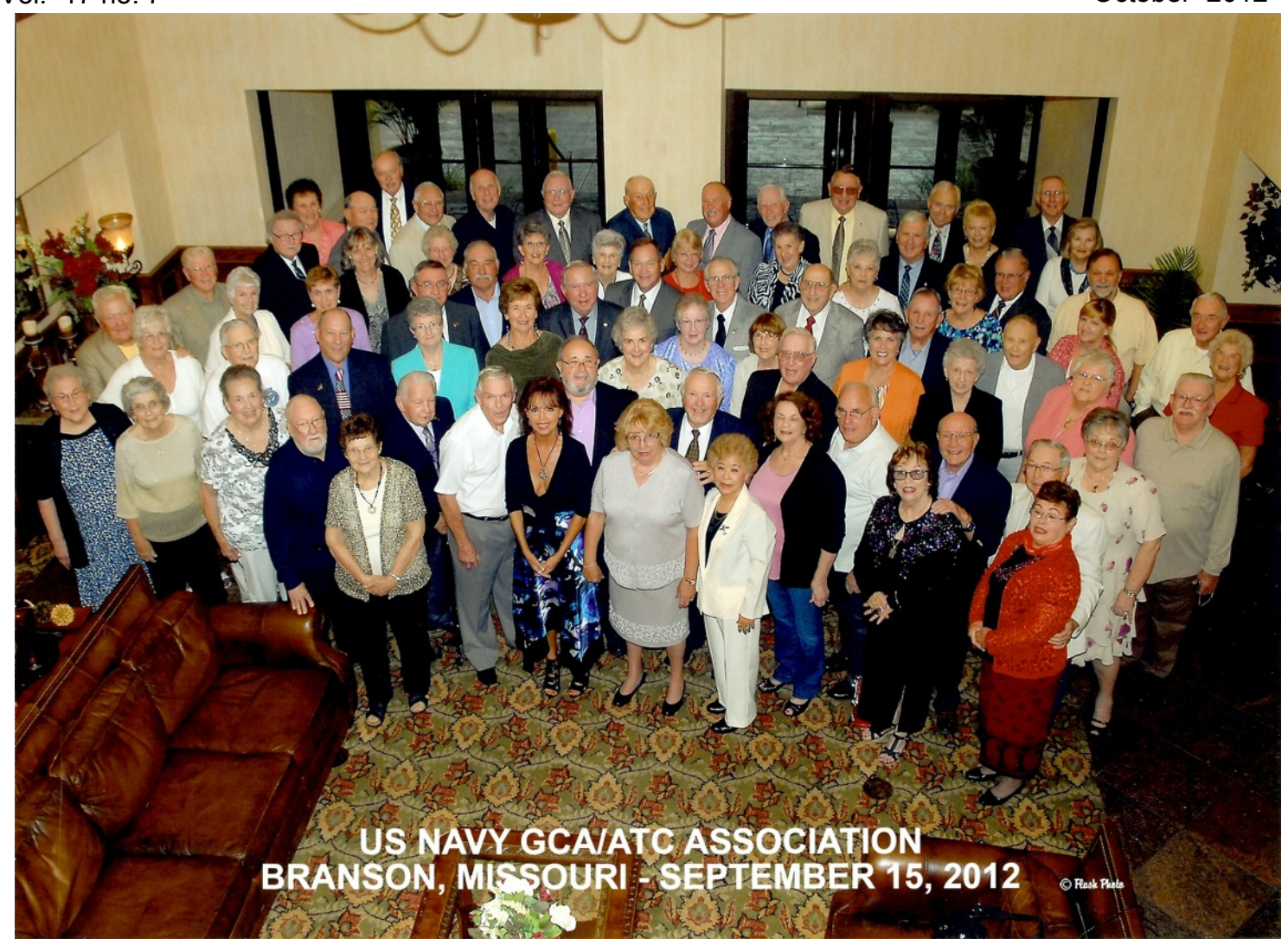
Here's the Banquet Crowd. The Culmination of a Great Reunion!!