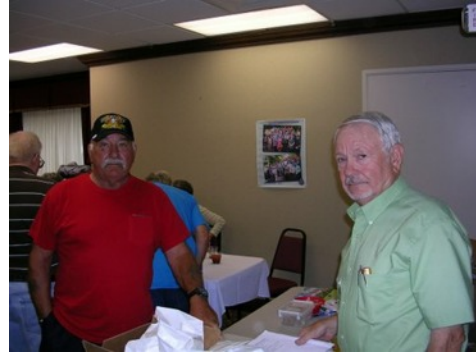
The VEEP and PREZ