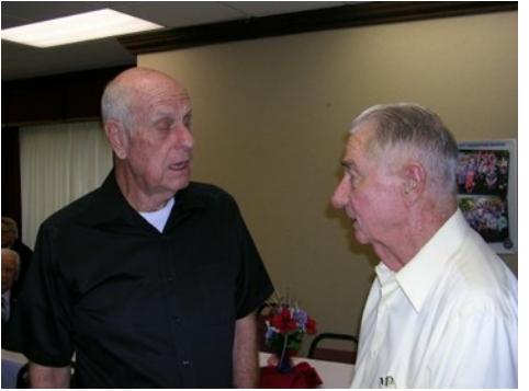
Serious Business ?